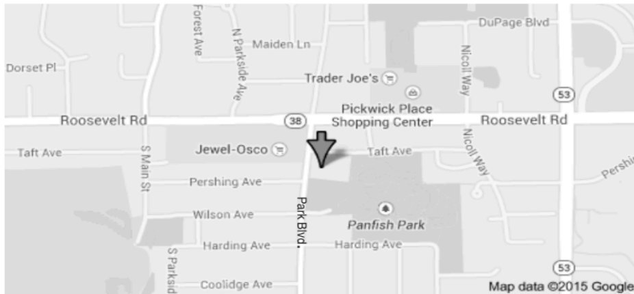
Glen Ellyn Office 45 S. Park Boulevard #220 • Glen Ellyn, IL 60137